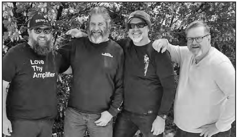
Vintage People Band