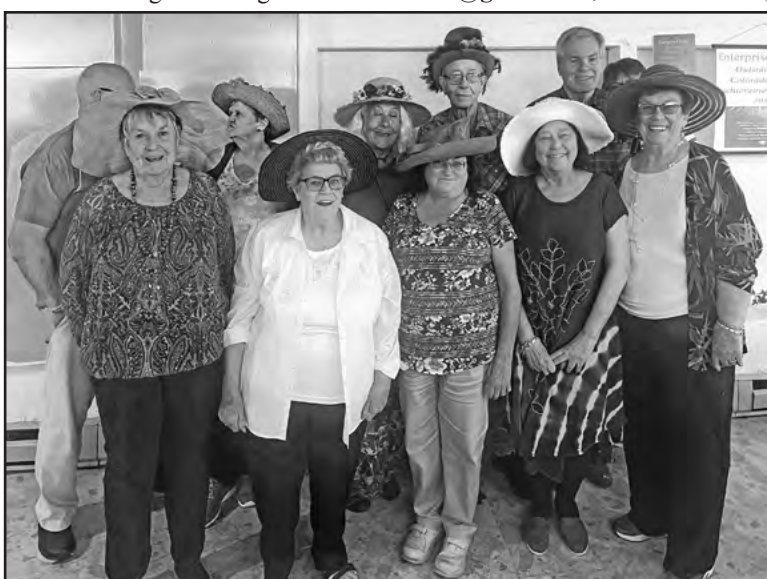
Darden Pomona's Quarterly Meeting held at Enterprise Grange was Kentucky Derby themed with a potluck, bingo, and watching the race.