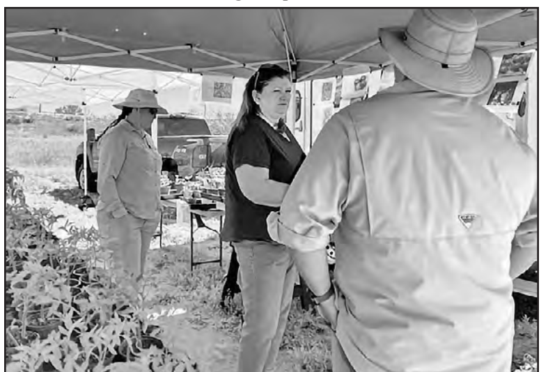
Sunflower Grange 11th Annual Heirloom Tomato & Plant Sale.