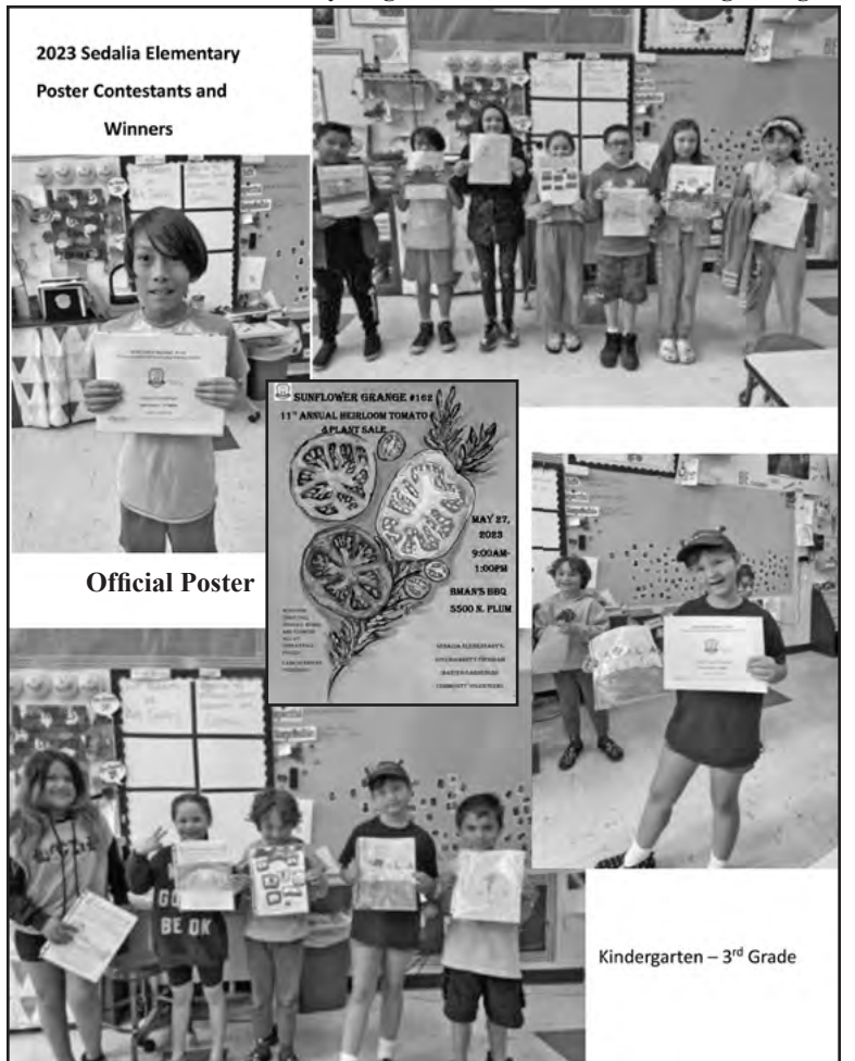
2023 Sedalia Elementary Poster Contestants and Winners Photos.