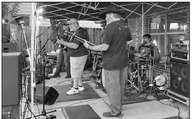
Vintage People Band playing at Sunflower Grange.