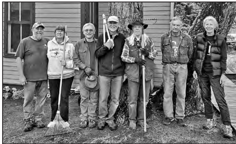
Pleasant Park work crew keeping things looking good at our Grange.