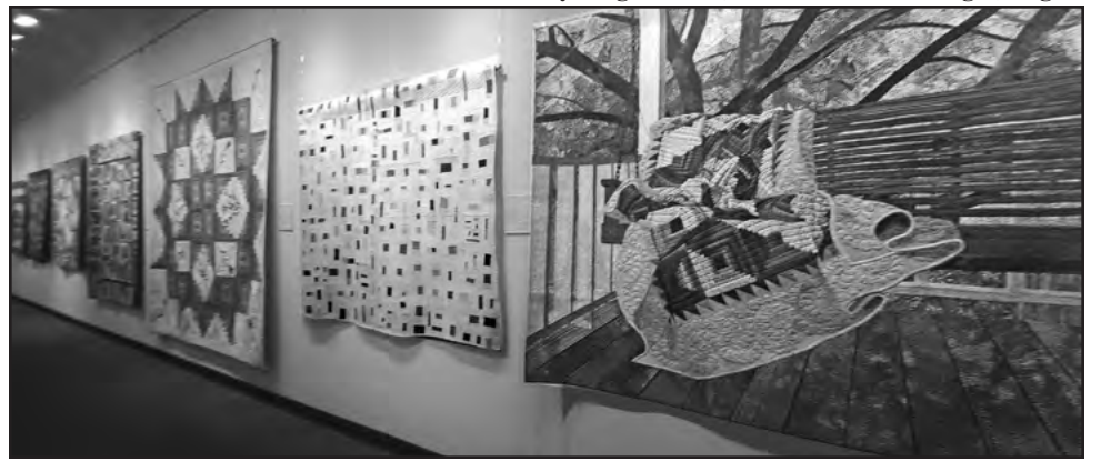
In April Enterprise Grangers, left, took an outing to the Rocky Mountain Quilt Museum to see their new main exhibit "Logs on a Roll Log Cabin Quilts." Some favorites above.