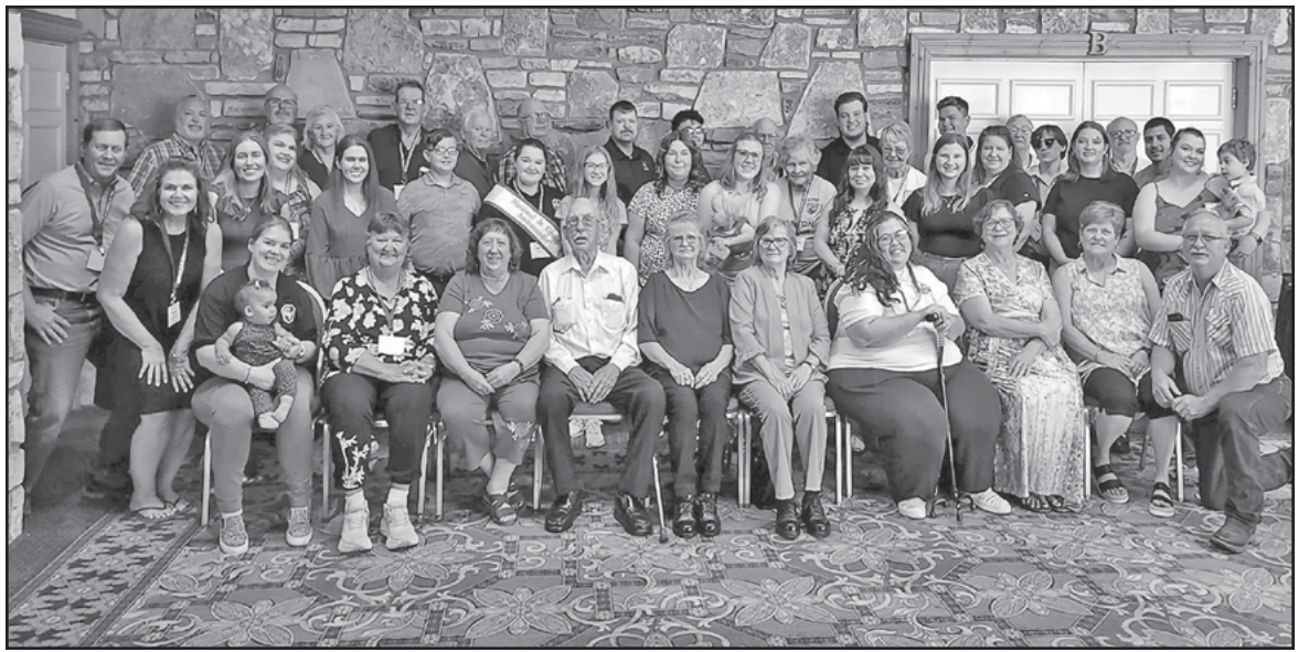
Great Plains Regional Conference participants in Kerrville, Texas in June 2023.

Send to: Colorado State Grange 7629 County Road 100, Hesperus, CO 81326