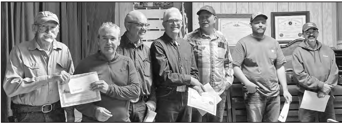
Marvel Grange recognized Road and Bridge Department employees at their April potluck.