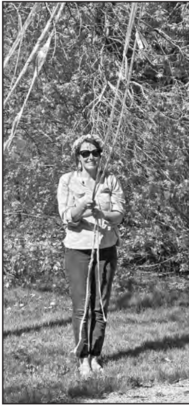
Mount Lookout Grange celebrated The Mancos Bloom with a Maypole dance which was fun for all ages.

Our summer will be filled with community events such as The Burro Fest in June and Mancos Days in late July, that our Grange is always asked to participate in, and do so