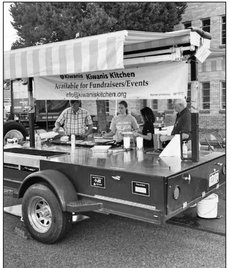
Grange members using the Kiwanis Traveling Trailer for their annual Pancake Breakfast.