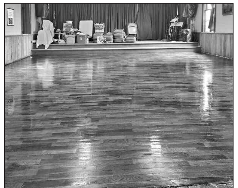
Florissant Grange Refinished Floor.