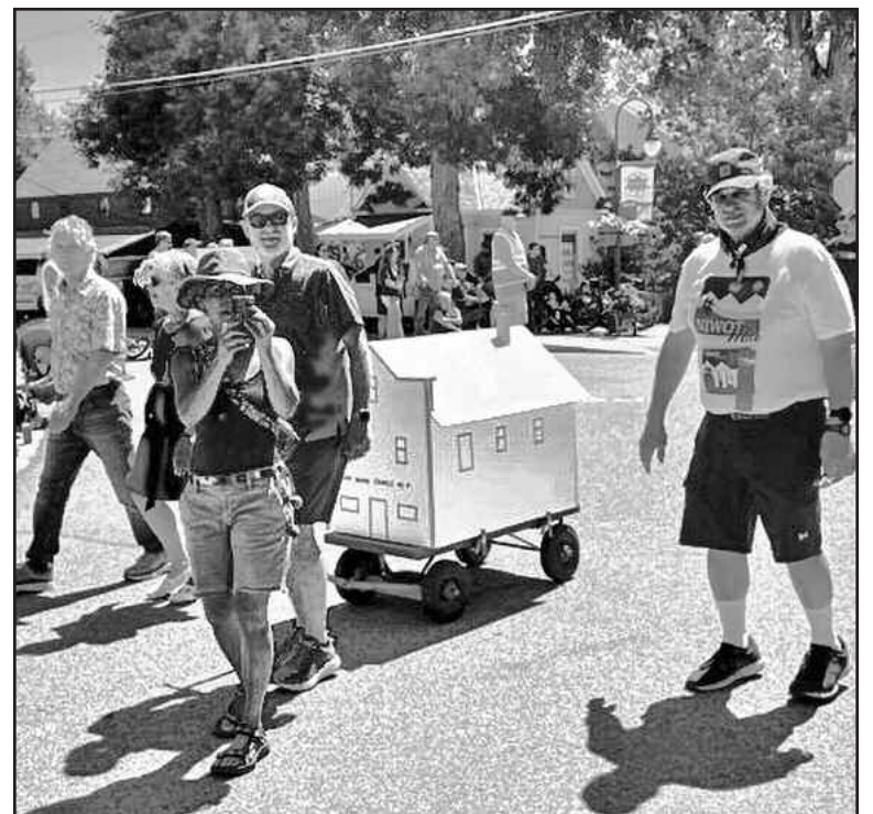
4th of July Parade 2022 — Left Hand Grangers with No. 9 with model.

4th of July Parade — The Left Hand Grange #9 actively participated in the Town of Niwot's 4th of July Parade (see photo). Grange members are seen pulling and accompanying a wooden model of the Left Hand Grange #9 built by the late Dick