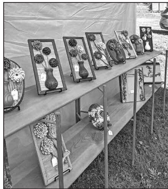
200+ visitors visited crafters and vendors during the Heritage Day celebration.