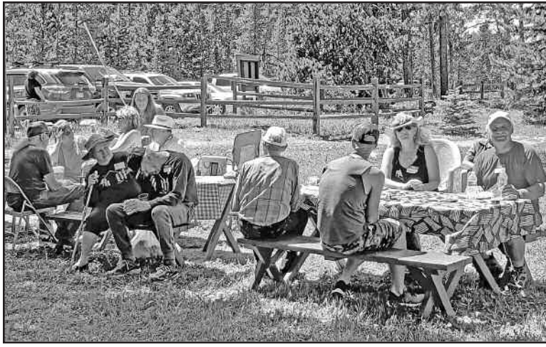
Grangers enjoying the annual Darden Pomona Grange Picnic hosted by Pleasant Park Grange.