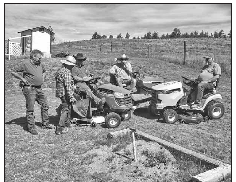
It takes a village — mowing before Heritage Day.