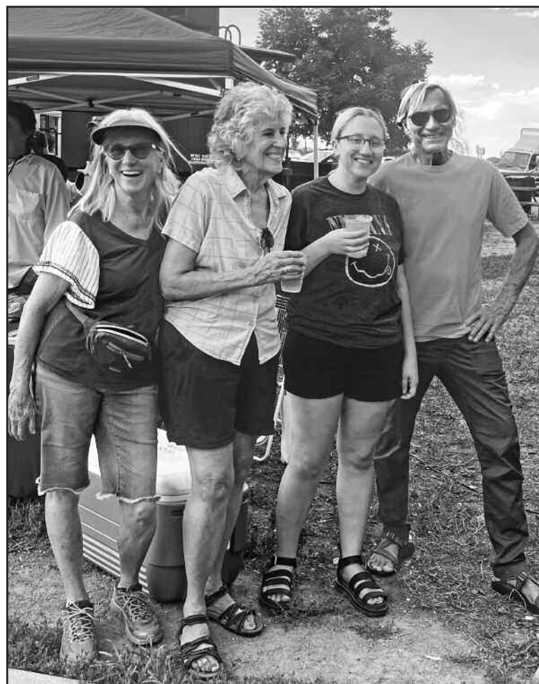
Left Hand Grange volunteers — Rockin' Rails Crew.

called Rockin' Rails. Members helped with set up and break down, greeting visitors, staffing the information booth, and handling sales of bottled water. The Grange was selected as a community organization, along with the Scouts from Troop and Pack 161, to benefit from the tip jars in return for providing volunteers for the event. (see photo of Grange members greeting visitors at the welcome tent.)