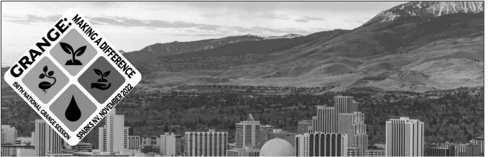
156th Annual National Grange Convention - Sparks, Nevada