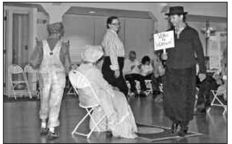
The Rose Drill Team.