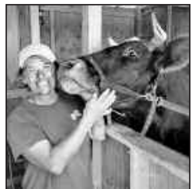
The "What's Up On Redlands Mesa" tour included a stop at Peace & Plenty Farm.

of art and nature that included hiking trails, museum quality art and beautiful views. The evening ended with music and wine tasting at Jack Rabbit Hill, our local vineyard with music provided by The Soul Brothers, one of our talented Grange members and his partner. The event was such a success that we are already planning for next year.