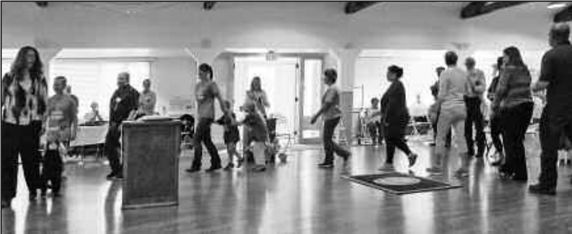
Juniors marching in to open Session on Saturday.