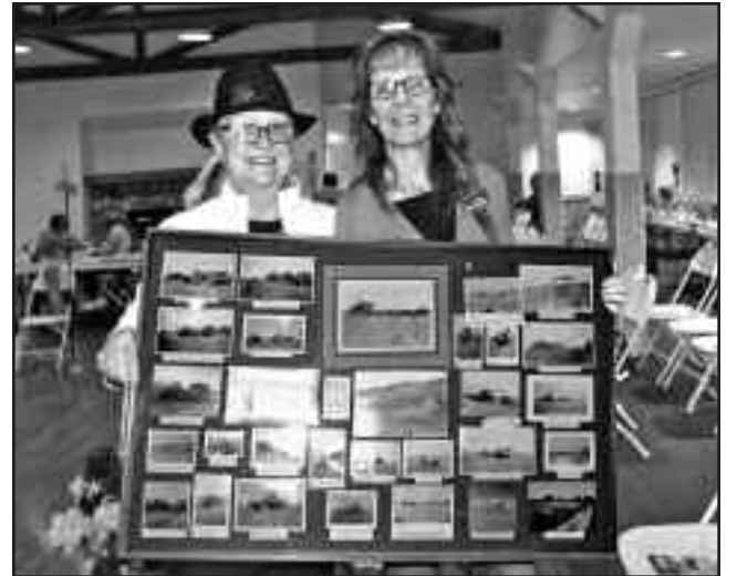
Photos of the past found by Great-Great and Great-Great Granddaughters.