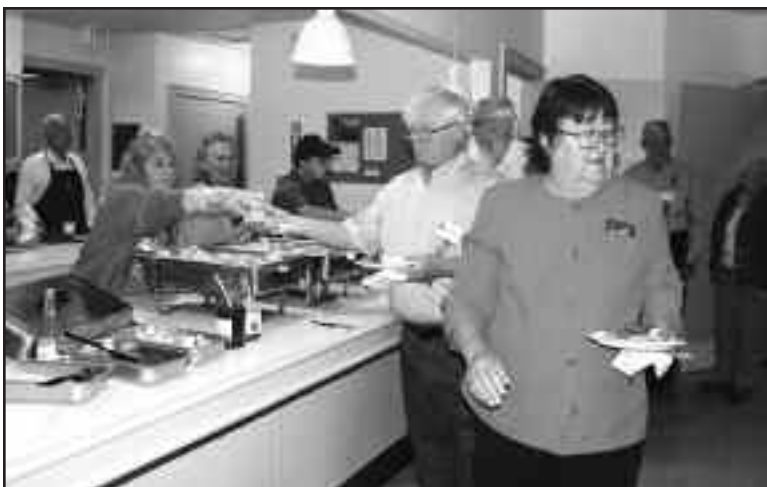
Florissant Grangers serving breakfast at State Session.