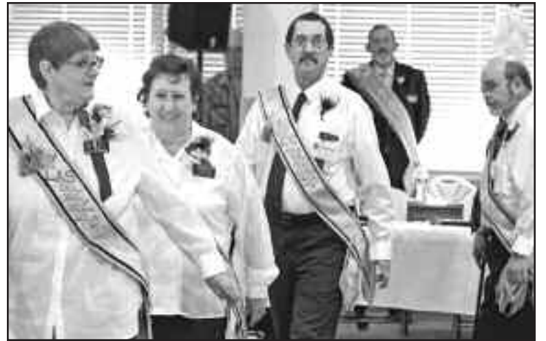
State Officers marching in.

bidding on items and attending to the tables, and Thank you to everyone behind the scenes who did something we don't know about. We can't say thank you enough to each and every one of you for everything.