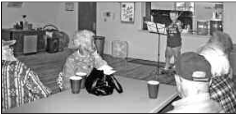
Exhibit Day at Florida Grange.