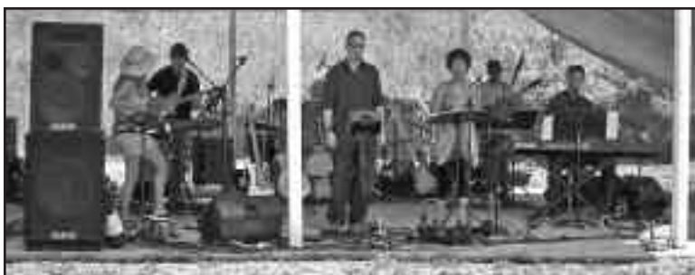
Beatles Tribute Band Captain Quirk and Friends performed in July.