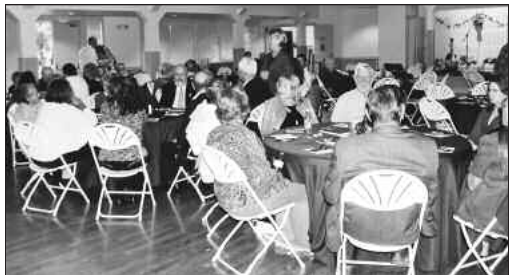
Grangers enjoying the Banquet.