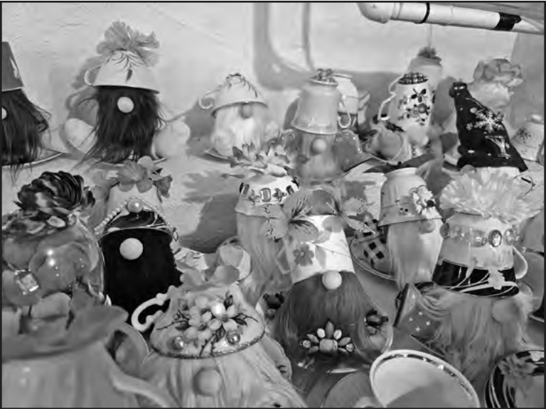
Display of Enterprise Grange’s gnome teacups.

from July to September with a brunch picnic at 10 a.m.