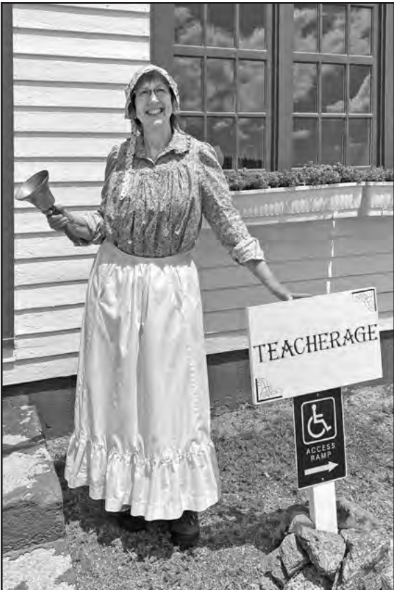
The Historic Society had the museum open on Heritage Day.

Harvest Host camping has kept us very busy this summer. We have