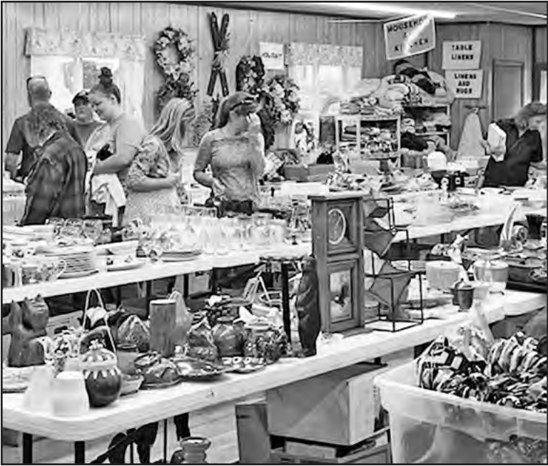
Golden Gate Grange Annual Rummage Sale was a great success!