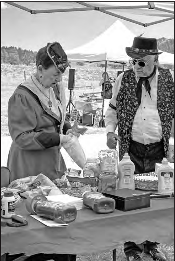
Hamburgers, hot dogs, brats, and ice cream were served to approximately 300 attendees.

Deadline for the November-December 2025 Issue Of The Colorado Granger Newspaper Is October 15, 2025.