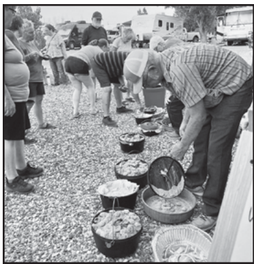
Dutch Oven Dessert Night at the Grange Revival.