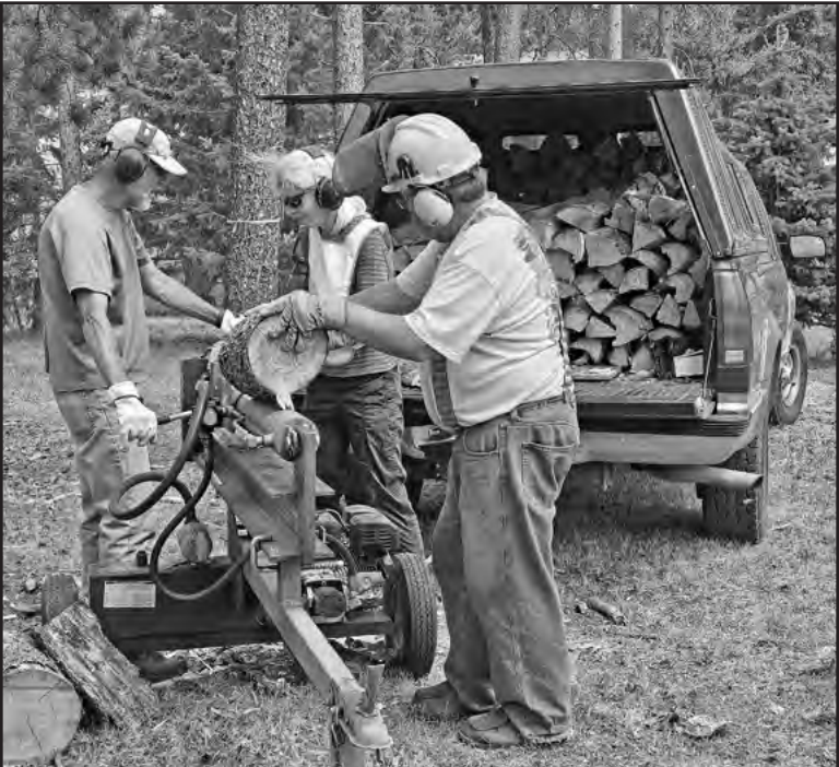
Trees had to be cut down at Pleasant Park Grange, with some of the firewood donated to members in need and plenty left to heat the Grange.