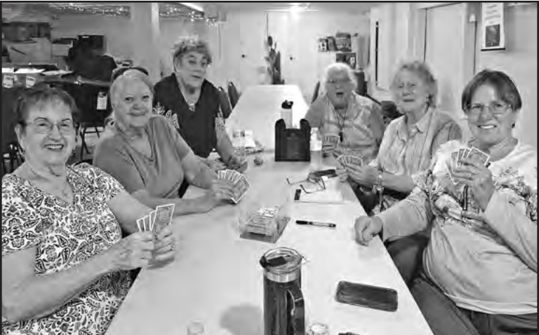
Hand and Foot Canasta made for an enjoyable Grange afternoon.

Everyone is invited to join us for a warm and festive Thanksgiving celebration! Guests from Carin’ Clinic and Shannon’s Hope will be joining Grangers, friends, and family for an evening of fellowship and gratitude. Our feast will be a traditional potluck complete with turkey and all the trimmings. The Grange will provide turkey, potatoes with gravy, beverages, and desserts. Guests are encouraged to bring a favorite holiday side dish to share. We will be collecting non-per-