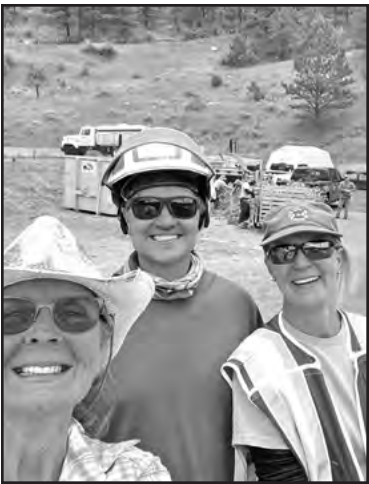
Slash Day resulted in 72 truckloads of slash being removed from Golden Gate Canyon.

In lieu of flowers, memorial donations can be sent to: The Golden Gate Auxiliary (which supports volunteer firefighters) P.O. Box 17623 Golden, CO 80403 OR Special Olympics of Colorado, 12450 E. Arapahoe Rd, Suite C Centennial, CO 90112.