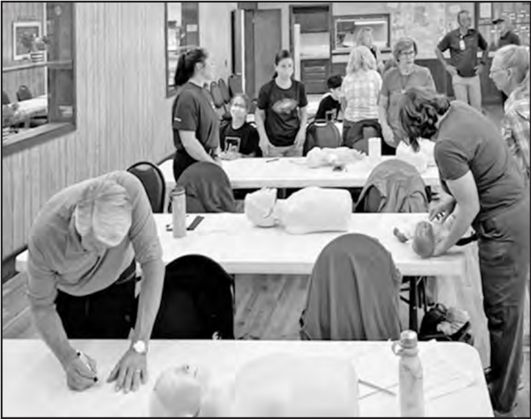
Certifications were awarded to 13 participants in the First Aid/CPR/AED Training at the Grange.