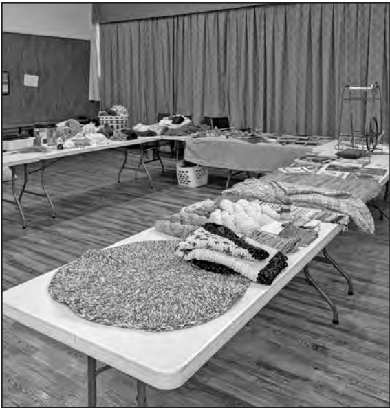
Fiber display presented by Southwest Fiber Alliance

Grange phone: 303-273-9516. Jayne Ruesch