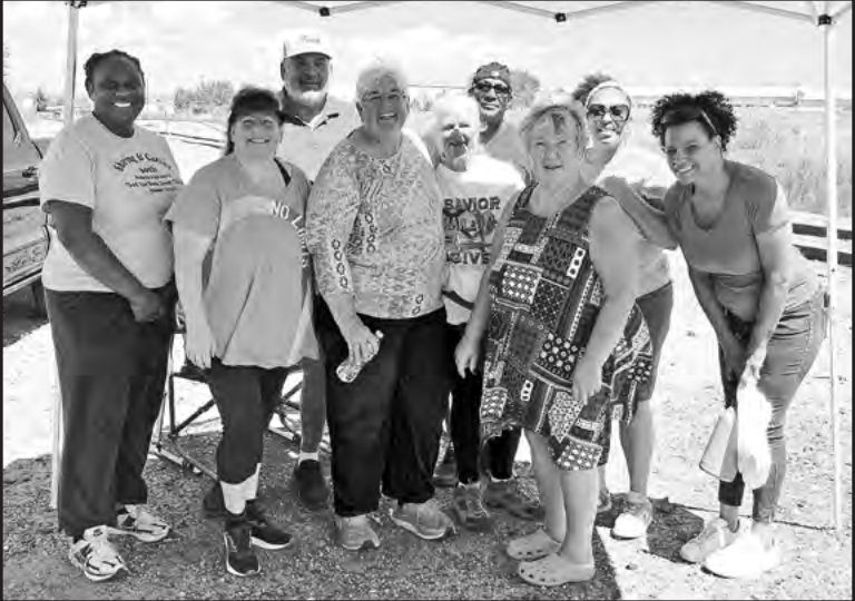
Volunteers from Garden Home Grange and Sharing and Caring Christian Center handed out over 200 bags of food made by Feed the City.