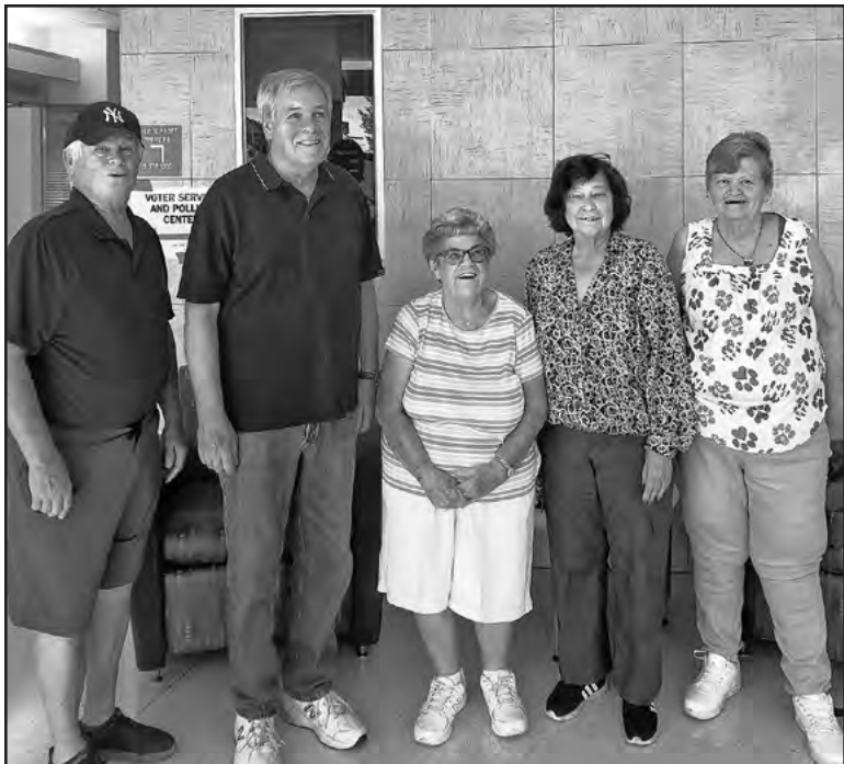
This Enterprise Grange group went on a very interesting and informative tour on Jefferson County Election ballot processing and security.

set it up for us to see the vote sorting machine in action. The sorting machine can process 50,000 ballots an hour. Each ballot goes through twice. On the first pass, it takes a picture of the signature envelope and then scans the barcode, which is attached to your voter ID.