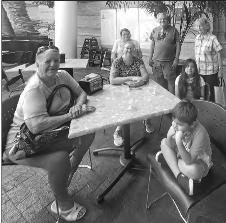
Enterprise Grange group at the Denver Museum of Nature and Science to watch the 3D movie "T-Rex" at the Infinity Theatre.