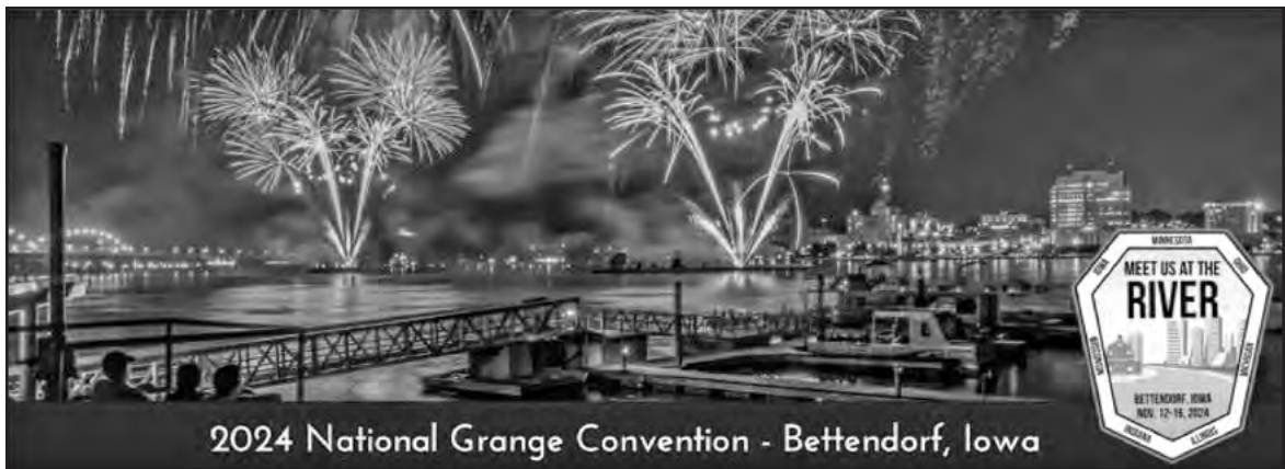
2024 National Grange Convention - Bettendorf, Iowa