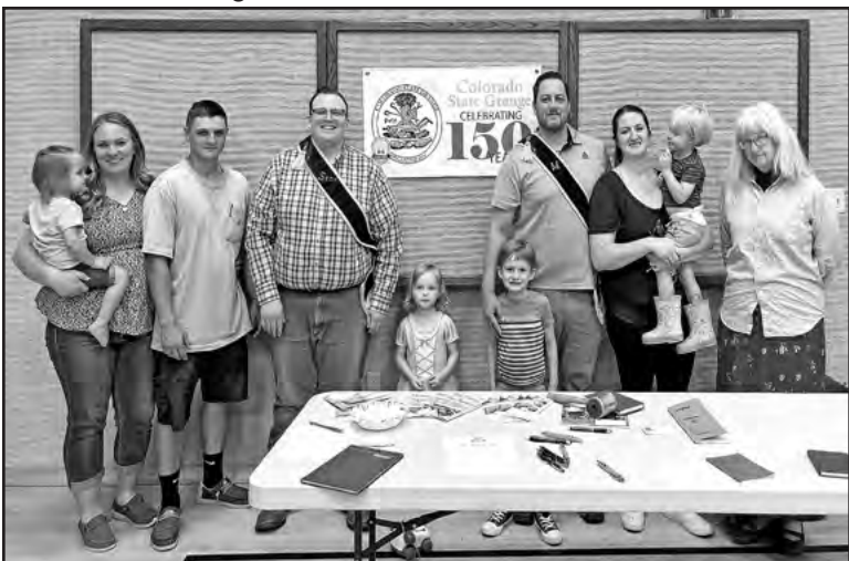
Platte Valley Initiates