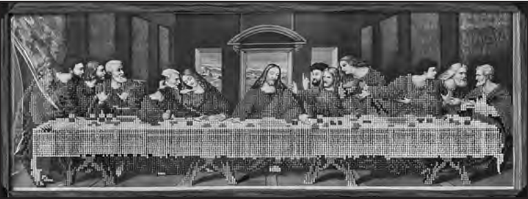
Framed Diamond Painting made by Karen Ray.

Please note that there are fewer Junior Grange craft and photography categories this year. There will be four age groups: Under 5, 5-7, 8-10 and 11-14. Please note; the handbook mistakenly lists three age groups. There are three photography categories: Scenes, Animals, and People. There are five craft categories: 1. Holiday Decoration; 2. Work of Art (made with paint, pencil, markers, crayons, charcoal, pastels, clay etc.); 3. Nature Craft (any item made from natural materials like rocks, seeds, pinecones, vegetables, etc.); 4. Miscellaneous; and 5. Special Gift.