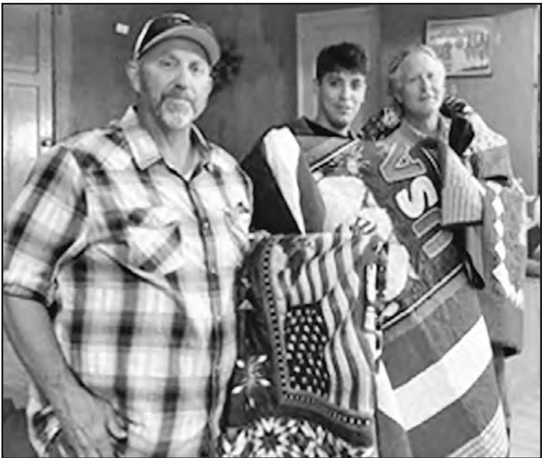
Three veterans honored with Quilts of Honor at Marvel Grange. October 19 — Tentative date for Luau.

Visit their web site at: www.seniorsurgicalguides.com .