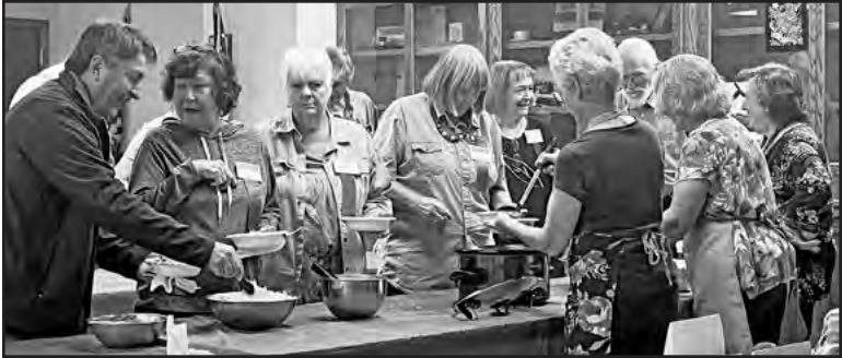
Grangers getting lunch during State Session in Durango.