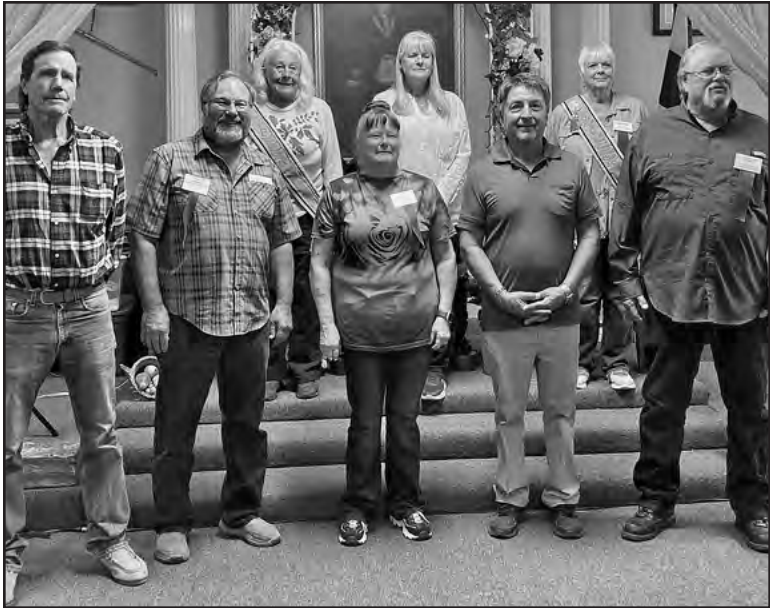
5th and 6th Degree Candidates with the Graces at State Session.