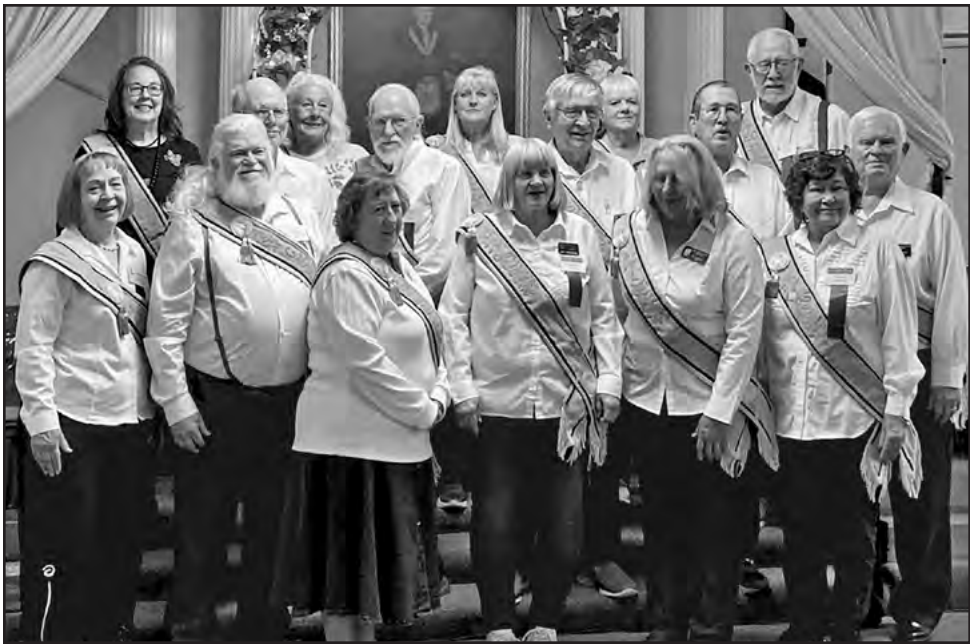
State Officers at the 151st State Session of the Colorado State Grange.