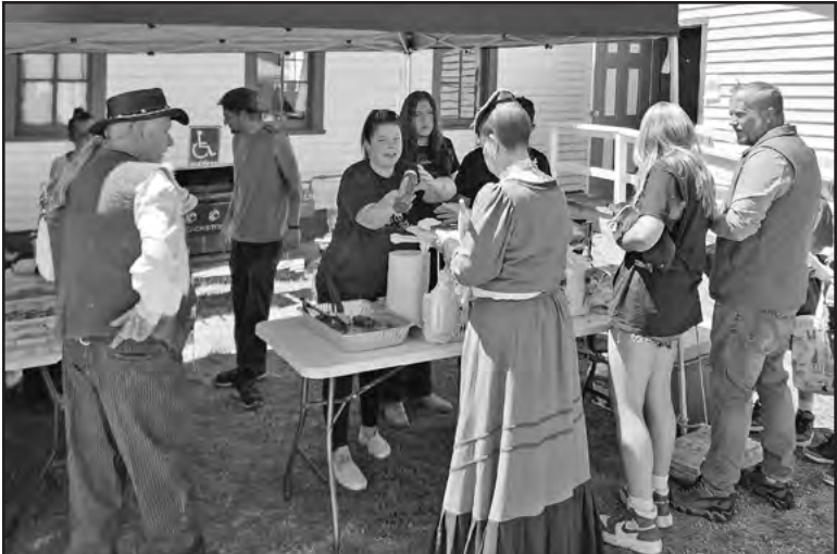
With over 300 in attendance, the whole community joined in the fun at Florissant Heritage days.

There are several documents available to help Seniors facing surgery. If you are interested in any of these documents, please let the state Grange office know and we can send you a copy or email a PDF copy. The topics covered are as follows: