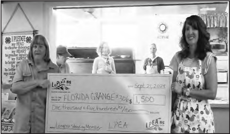
La Plata County Electric Association honored the long-standing relationship with Florida Grange with a $1,500 contribution.