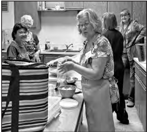
The Mt. Allison Kitchen Crew prepping for meals during State Session in Durango.