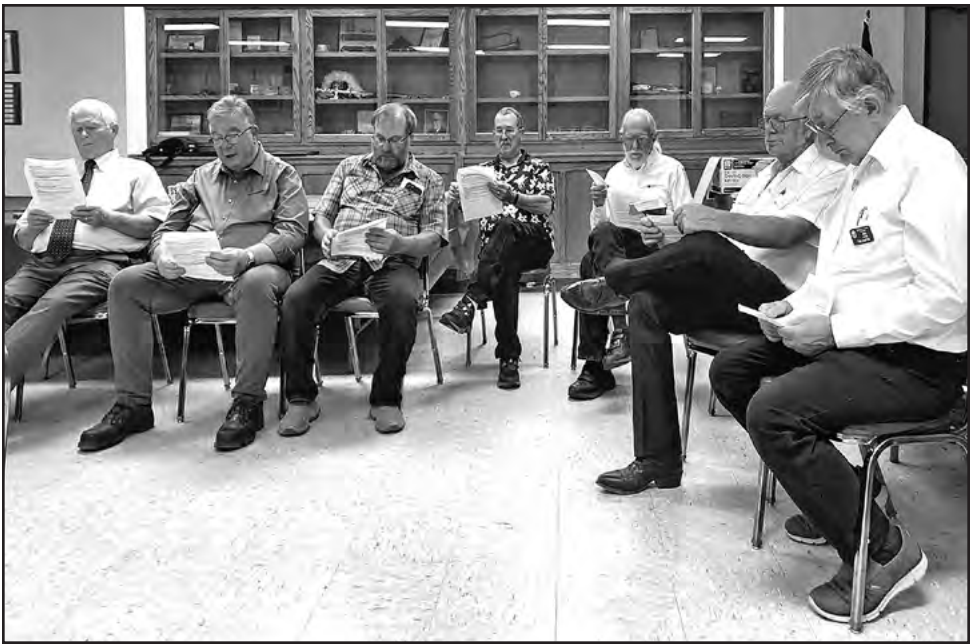
Founders Skit performed at State Session in Durango.